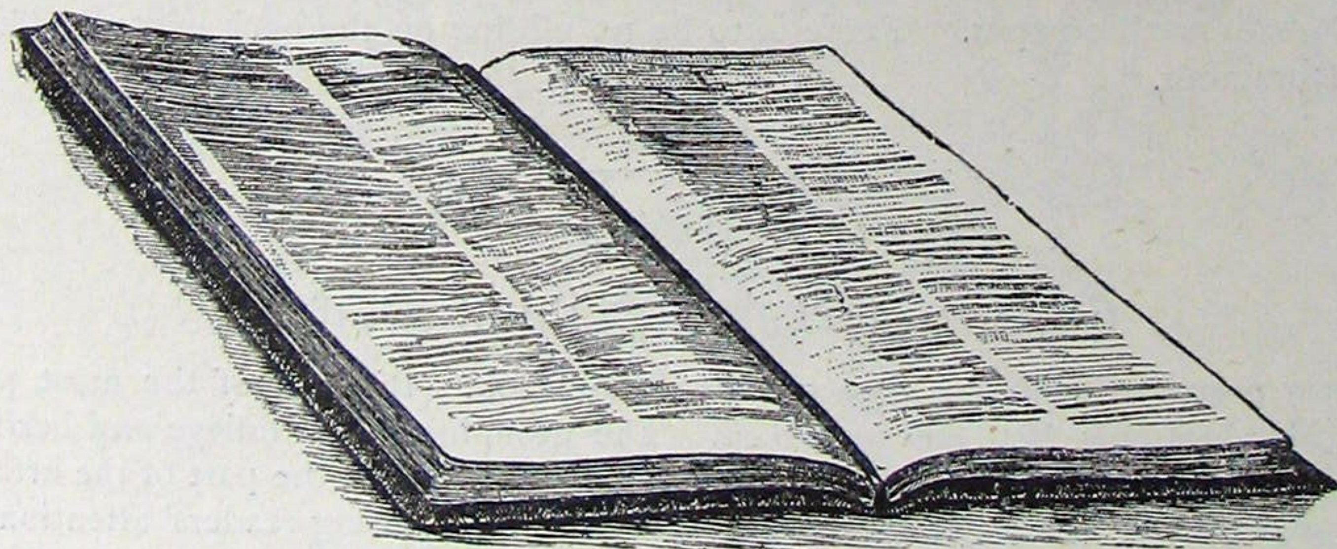
MAGAZINE COVER (open).

the rich Pompadour and Empire designs making very dainty-looking covers.