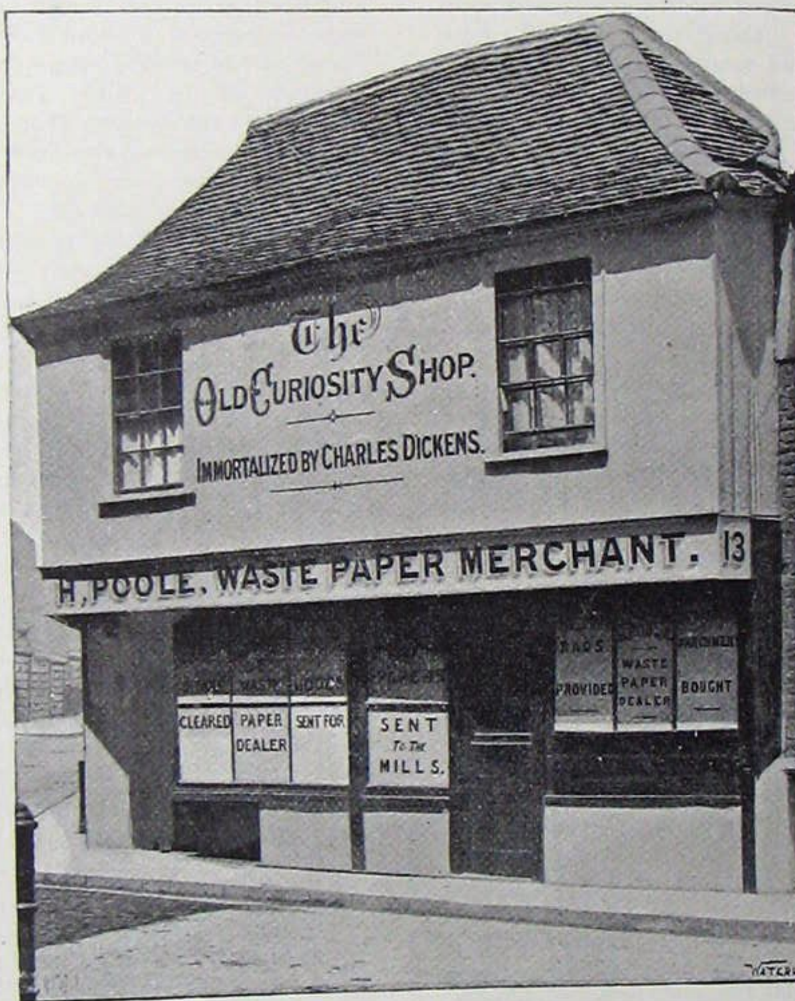
THE OLD CURIOSITY SHOP.

by. The old lady has many an anecdote of the future novelist, who was then only about eighteen or twenty, and looked, as she remarks, like a farmer's son or lad from the country. "He would lean his shoulder on the counter there," she cries with evident relish. "Ah! I can see him now, with his pleasant face, his quiet, rippling laugh, and gentle ways. Aye! whenever he laughed he always threw up his upper lip." Dickens read voraciously all the spirited fiction of the day, such as the tales of Fenimore Cooper, and the adventures of Dick Turpin or Captain Kidd. He would sometimes criticize the books to her, pointing out the faults or merits of various writers.